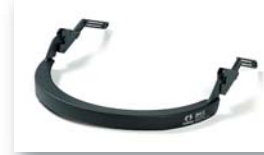
Visor carrier standard