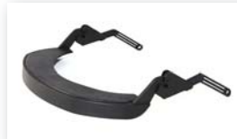
Visor carrier FLEX