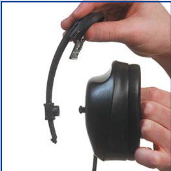
Attach the springarm to the cup.