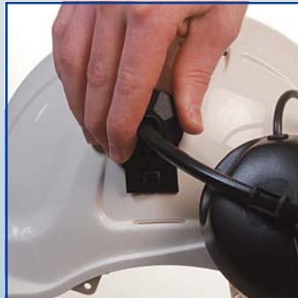
Push the cap attachment into the slot.