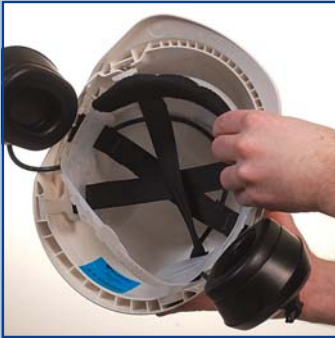
Remove the harness inside the cap and pull out the cable.