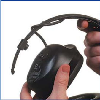
Release the cup from the headband slider attachment.