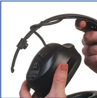
Attach the headband to the cup.