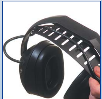
Place the cable in between the cable fixture.