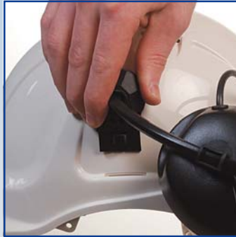
Release the cap attachment from the slot.