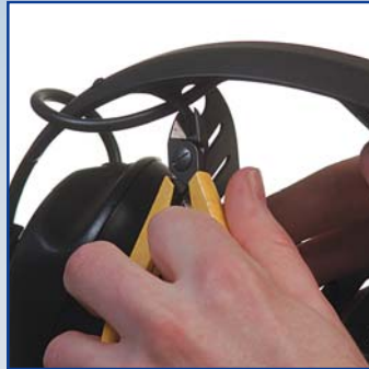
Make a cut in the comfort strap...