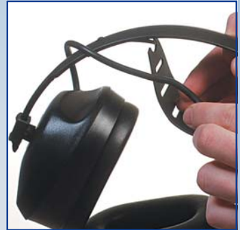
...and release the cable.