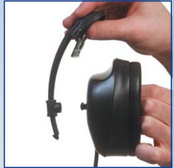
Remove the springarm from the cup.